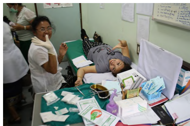
A woman at the Savannakhet Province Hospital in Laos gets a contraceptive implant by a nurse. 3024 implants have been delivered to Laos during 2014.

Since none of the other parties charge a fee for the guarantee, Sida also decided to waive the premium, which has a value of SEK 21 million.