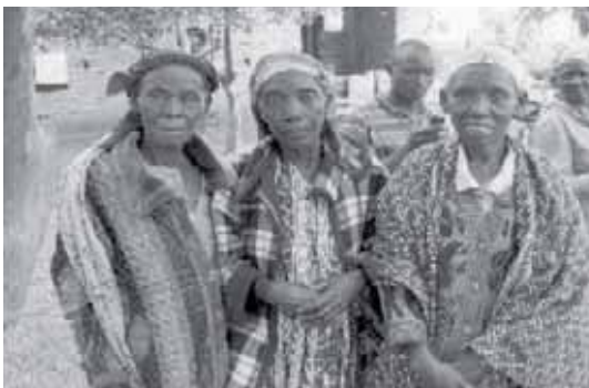
Women labourers, Road Project, Kenya

Women's sexual and reproductive health and rights have also been improved in a sustainable way through the community based approach to eliminating harmful traditional practices (HTP) in SARDP, particularly early marriage, and FGM, which both violate women's sexual rights and lead to health/reproductive issues, Changes in HTPs are not recorded or monitored by the project. However, one Woreda reported that early marriages had dropped