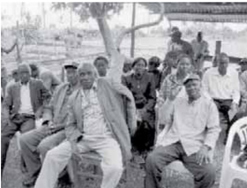
Men and women at community meeting, Gucha District.

The above example indicates that ‘training of trainers’ may not be sufficient – at least not in sectors where gender equality is not a primary sector concern, but where the way initiatives are implemented (e.g. the way road construction and maintenance is undertaken) have a large potential impact on gender outcomes. Training also needs to be accompanied by efforts reinforcing learning incentives in each group’s own lines of reporting.