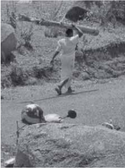
Women still carry the heavy loads due to limited means of transport. Some young men have started informal taxi services by motorbike.

The programme design recognizes gender issues related to road use and income generating activities. In line with Government Roads 2000 policy, gender indicators for employment have been established where a minimum of 30% of the unskilled workforce and trained contractors should be women. A socio-economic baseline was carried out, with some sex disaggregated data, but no monitoring has been carried on social benefits and/or gender outcomes of interventions.