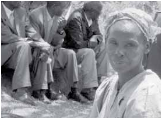
Representation through the local Roads Committee.

Nyanza Roads 2000 Programme covers 11 districts in the Nyanza Province with the aim to improve and maintain a total of some 10,400 km of road over four years, using labour-based approaches that “empower the community” and in particular women and vulnerable groups. After a two-year preparation period, funding started in 2005 and will be phased out in 2011. The project is co-financed with GoK and executed through the Ministry of Transport/Kenya Rural Roads Authority. Besides roads improvement and maintenance there are components covering soil conservation, training and awareness creation, and capacity building.