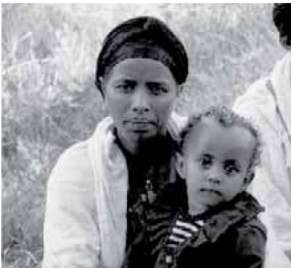
Member of Women's savings and loans group, Amhara

Women in both projects tended to spend money on household consumption, school fees or asset protection either supplementing or replacing men's incomes. Men on the other hand, tended to spend additional income (that wasn't spent on alcohol or politics) on long-