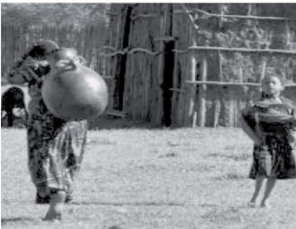
Women's work – carrying water, Amhara

Reducing women's workloads by having men share responsibility for housework and childcare is more strategic than labour saving devices, although both