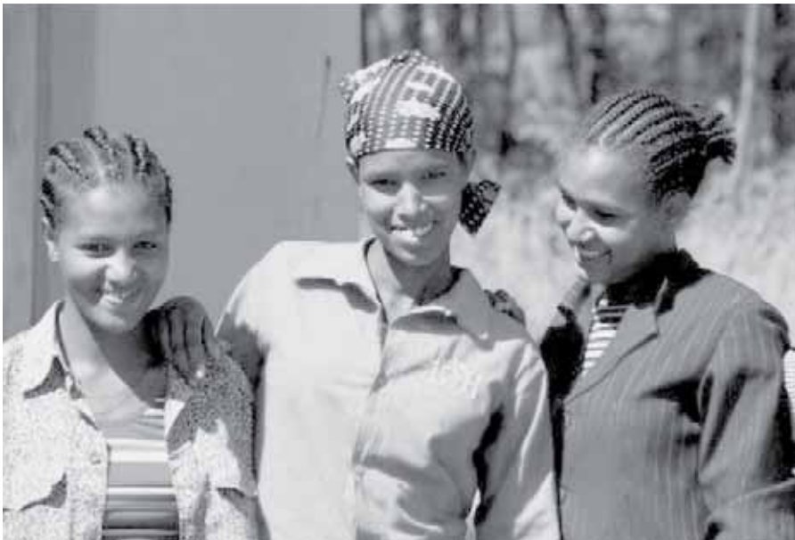
Girls in preparatory school dormitory, Amhara