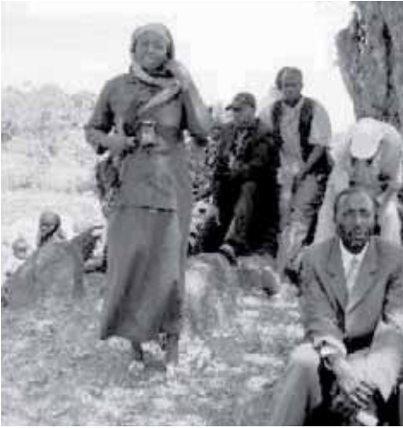
Woman Treasurer of local Roads Committee, Kuria District