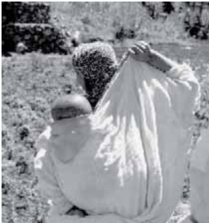
Model vegetable farmer, with grandchild. Amhara

SARDP is an integrated rural development programme with four pillars: Agriculture and Natural Resource Management (ANRM); Infrastructure and Social Service Development (ISSD); Economic Diversification (EDC), and; Decentralization. The overall purpose of the programme in Phase 3 was “to contribute to poverty reduction of the Amhara Region by improving the food security conditions of the population in 30 Woredas of East Gojjam and South Wollo.” A comprehensive and generally positive evaluation of the whole programme was carried out in 2009. 14